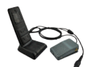
Desktop Mic & Pedal PTT